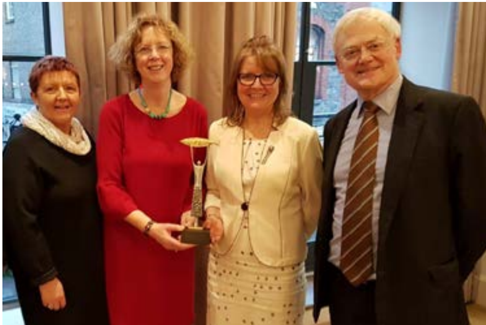
KHF received the Brian Wilson Philanthropist of the Year 2019 award from the Community Foundation for Ireland in January 2019.

It is also encouraging that the Infant Development Fund which was established as part of the Nurture Programme in collaboration with the Community Foundation for Ireland will continue to build on and support the work of both the Parenting Support Initiative 2013-2016 (PSI) and the Nurture Programme.