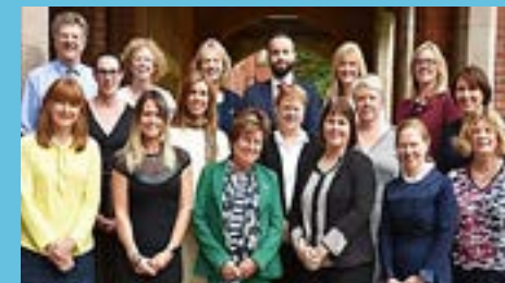
The Parenting Network members at the Steering Group meeting in Belfast, NI.

a Networking Grant to support the future development of the Network. Through this support, developments in 2019 included finalising a policy response to the First 5 Strategy Implementation Plan; building on the Network's communication strategy with members, including the development of a website and; connecting with the new Parenting Policy Support Unit in DCYA. There was also a focus on a number of learning events, where member organisations came together to explore themes relevant to supporting parents. A Workshop on 'co-production with parents' is also planned for early 2020.