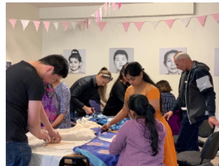
The parents from the preparation for preschool 2018/2019 participating in Hill Street FRC networking café, making bunting for Hill Street 20th anniversary and Family Intercultural fun day held on 27 June 2019.