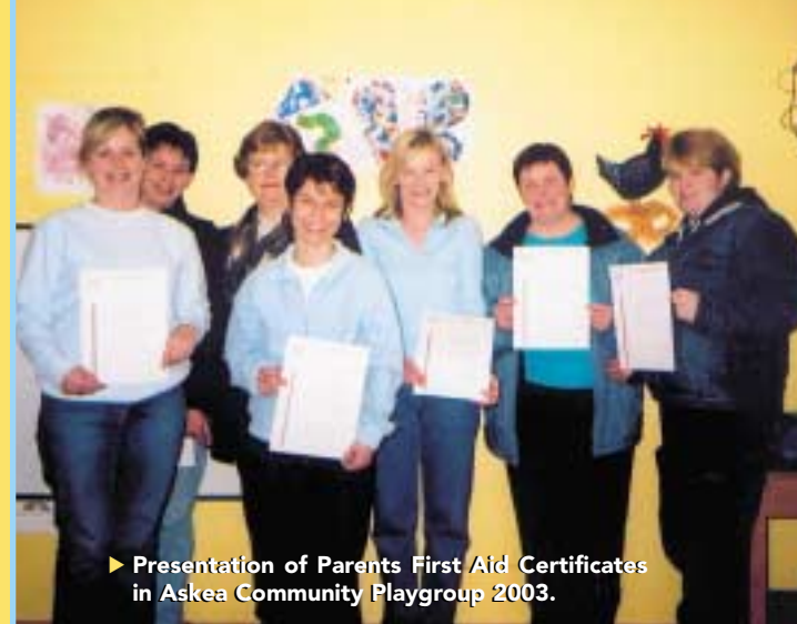
► Presentation of Parents First Aid Certificates in Askea Community Playgroup 2003.

These funds have been spent on implementing planned improvements. A wide variety of such improvements has been made, including updating and upgrading premises for e.g. Slieverue renovated their whole room (see photos below). They installed child-sized toilets and sinks, repainted the walls, ceiling and floor, put in a wheel chair accessible toilet and revamped a small kitchen area. Many of the others have put down new floor covering, installed new windows and doors, repaired heating and provided hot water. Others have taken on new staff - Askea, St.Oliver's, Teach na bPáistí and Slieverue employed new staff members in the past year. Askea and St.Oliver's opened up an afternoon session and Slieverue hope to do so after Christmas. Several of the staff are undertaking F.E.T.A.C. (Further Education and Training Awards Council) Level Two Training in Childcare while other staff members have been able to attend one-day work shops, conferences, training on sign language and special needs. Information and training for parents has been provided by some of the groups - Askea offered a subsidised course on First Aid to parents (see above photo). They also held a session on the value of play and another one on caring for young children. The evaluation also selected 25% of parents to take part in a telephone survey in early 2003, and asked