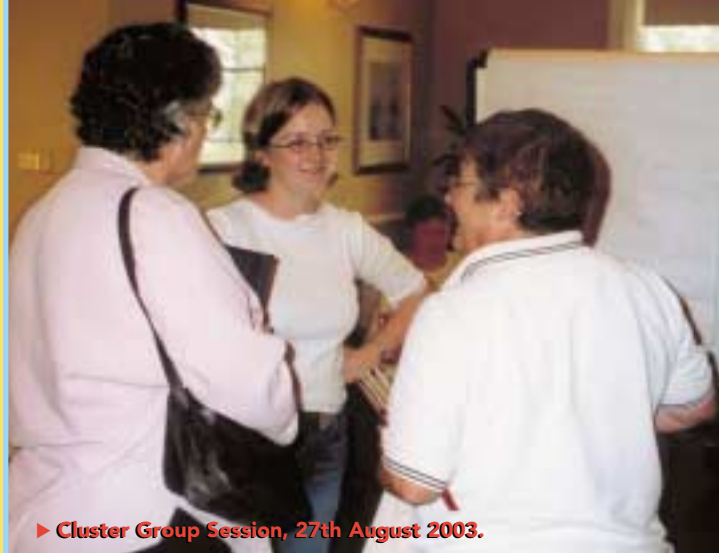
► Cluster Group Session, 27th August 2003.

those who are seen to be disadvantaged. Even for these children services are sadly lacking and most measures to date have been aimed at primary and post-primary aged children according to the National Economic and Social Forum (NESF, 2002). Thus, trying to ensure that the youngest children in Ireland are valued and supported by the provision of appropriate services is not an easy task.